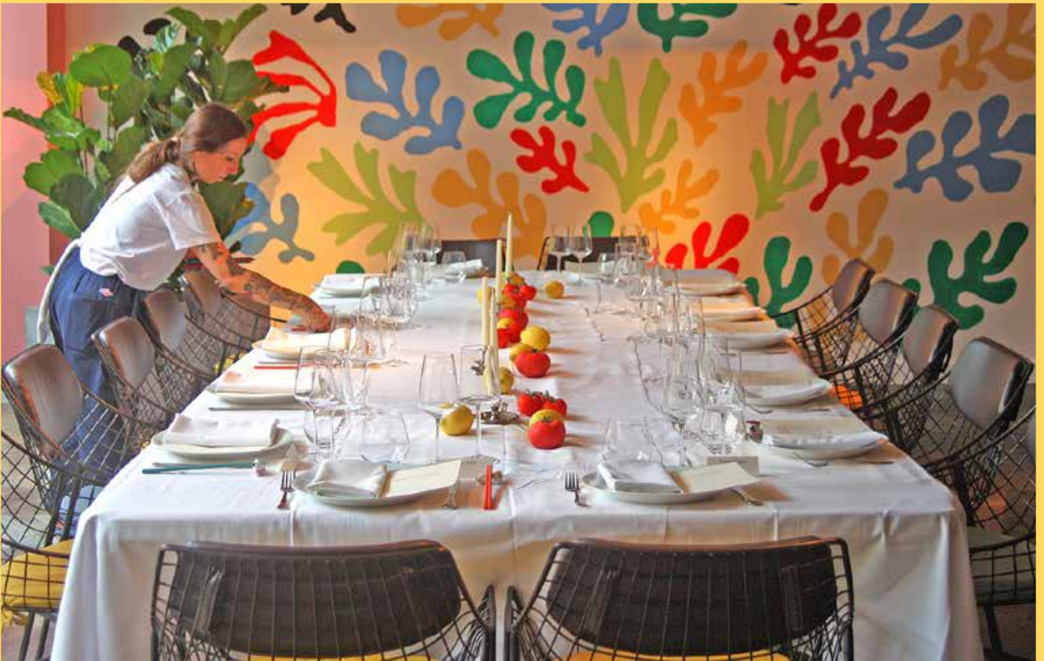
Area 3 'Flowers', place setting for 14